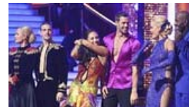
'Dancing With the Stars' Finale Live Blog: Who Won?