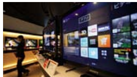
Sony, Samsung Rein In TV Discounters