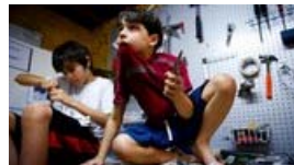
How Parents Enable Kids' Creativity