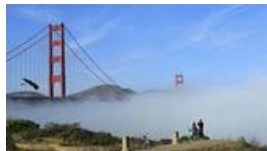
Will the Golden Gate Show for Its Birthday?