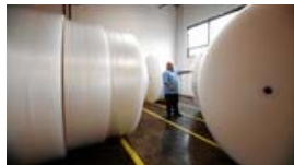
You Call That Innovation?